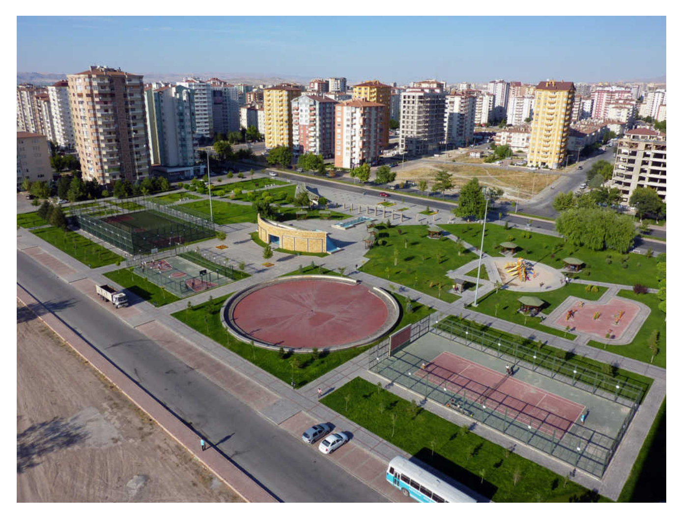
DAY 05: HOT AIR BALLON RIDE AND CITY TOUR

You have an early wake up call today at 04:00 AM for your hot air balloon ride. Post the balloon ride you have a city tour of the place where you'll visit all the major attractions of the city, the tour ends at 04:00 PM. The rest of the day is free for you to roam, explore and shop around the city on your own.