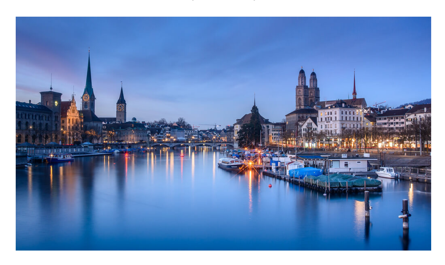
DAY 06: HEAD FOR PARIS & PARIS EVENING TOUR WITH EIFFEL TOWER

Check out of your hotel in Interlaken today. And board the train for Zurich. Upon arrival, walk upto your hotel in Zurich. In the afternoon, you have a city tour of Zurich by a Local Tram scheduled for you. Visit the sights and learn about the city in this short tour. The rest of the day is free for you.