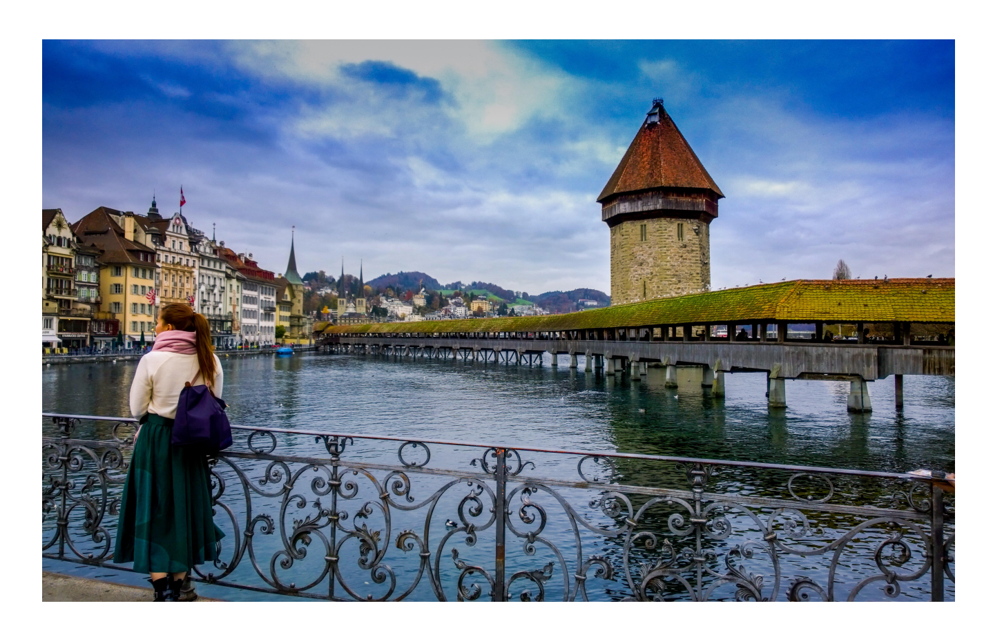
DAY 02: DAY TRIP TO MT. TITLIS

Have a scrumptious breakfast. Later get ready as you proceed to Engelberg using your Swiss Pass. From Engelberg, you go using the Gondola up the Mt. Titlis. This entertainment marvel has breathtaking views all around and plenty for you to see and experience like the ice museum, the snow rides etc. Return back to your hotel in the evening.