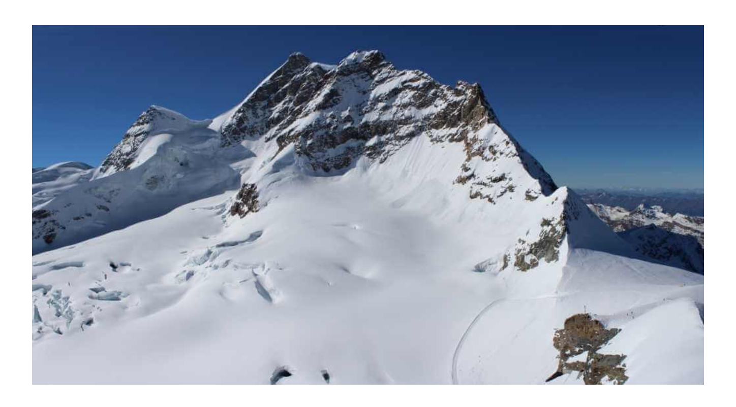
DAY 05: TRAIN TO ZURICH AND ZURICH CITY TOUR

Check out of your hotel in Interlaken today. And board the train for Zurich. Upon arrival, walk upto your hotel in Zurich. In the afternoon, you have a city tour of Zurich by a Local Tram scheduled for you. Visit the sights and learn about the city in this short tour. The rest of the day is free for you.