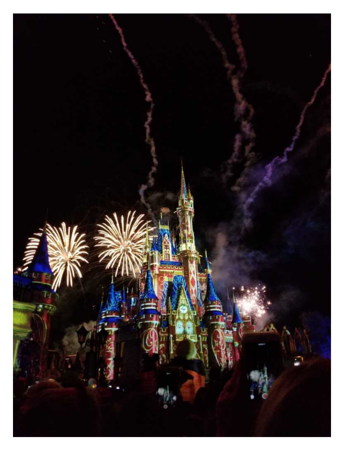
DAY 08: TO AMSTERDAM AND CANAL TOUR OF AMSTERDAM

Check out of Paris as you leave for Amsterdam. Upon arrival in Amsterdam, you