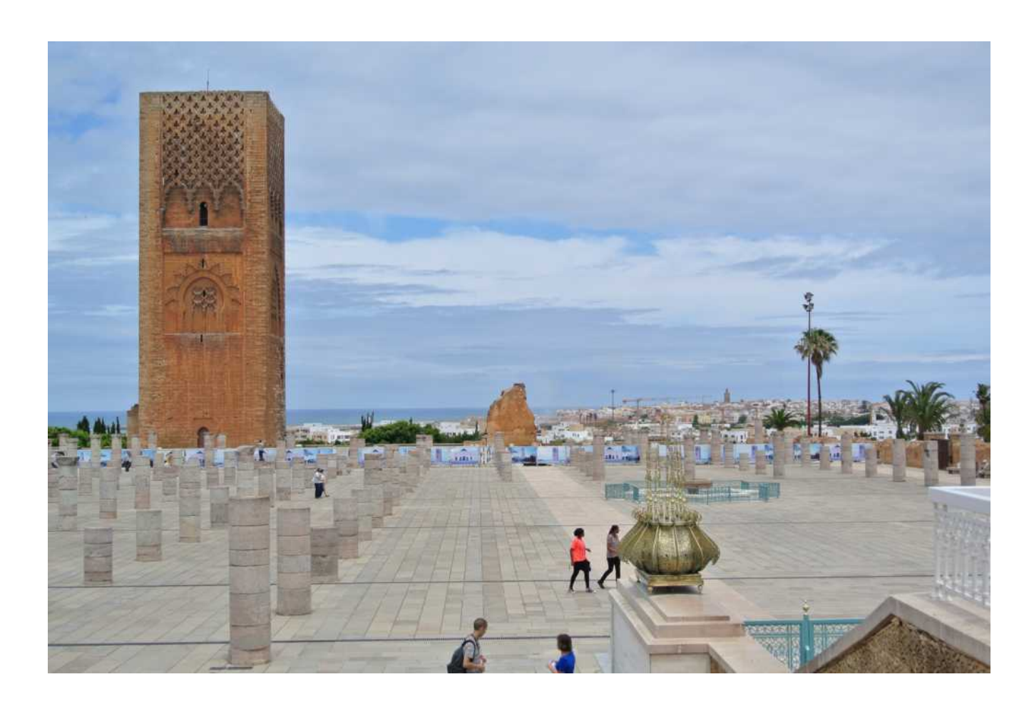
Day 8: VISIT TO HASSAN II MOSQUE

A tour of Rabat including the Mausoleum of Mohammed V. Later travel to Casablanca and then see the Jassan II Mosque Take a stroll along the Boulevard de la Corniche , the beach promenade that follows the Atlantic (often referred to as Morocco's 'Miami') to the Hassan II Mosque . Take advantage of the timing and watch the sunset behind the architectural marvel. Grab a bite in Rick's Café , a restaurant, bar, and café recreated to reflect the bar in the movie classic, Casablanca . Visit Hassan II Mosque. It sits on an outcrop over the Atlantic and has a 690 feet (210 m) minaret—the tallest structure in Morocco and the tallest minaret in the world! It is estimated the courtyard can hold 80,000 worshipers, with room for 25,000 inside. What makes this mosque unique is that it is one of the few mosques in the country non-Muslims can enter.