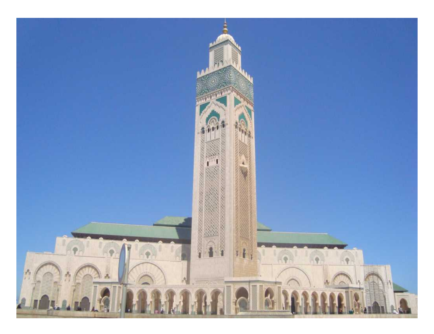
Day 9 & 10: TRAVEL TO ESSAOUIRA

Travel to Essaouira is a port city and resort on Morocco's Atlantic coast. Its medina (old town) is protected by 18th-century seafront ramparts called the Skala de la Kasbah, which were designed by European engineers. Old brass cannons line the walls, and there are ocean views. Strong "Alizée" trade winds make the city's crescent beach popular for surfing, windsurfing and kitesurfing.