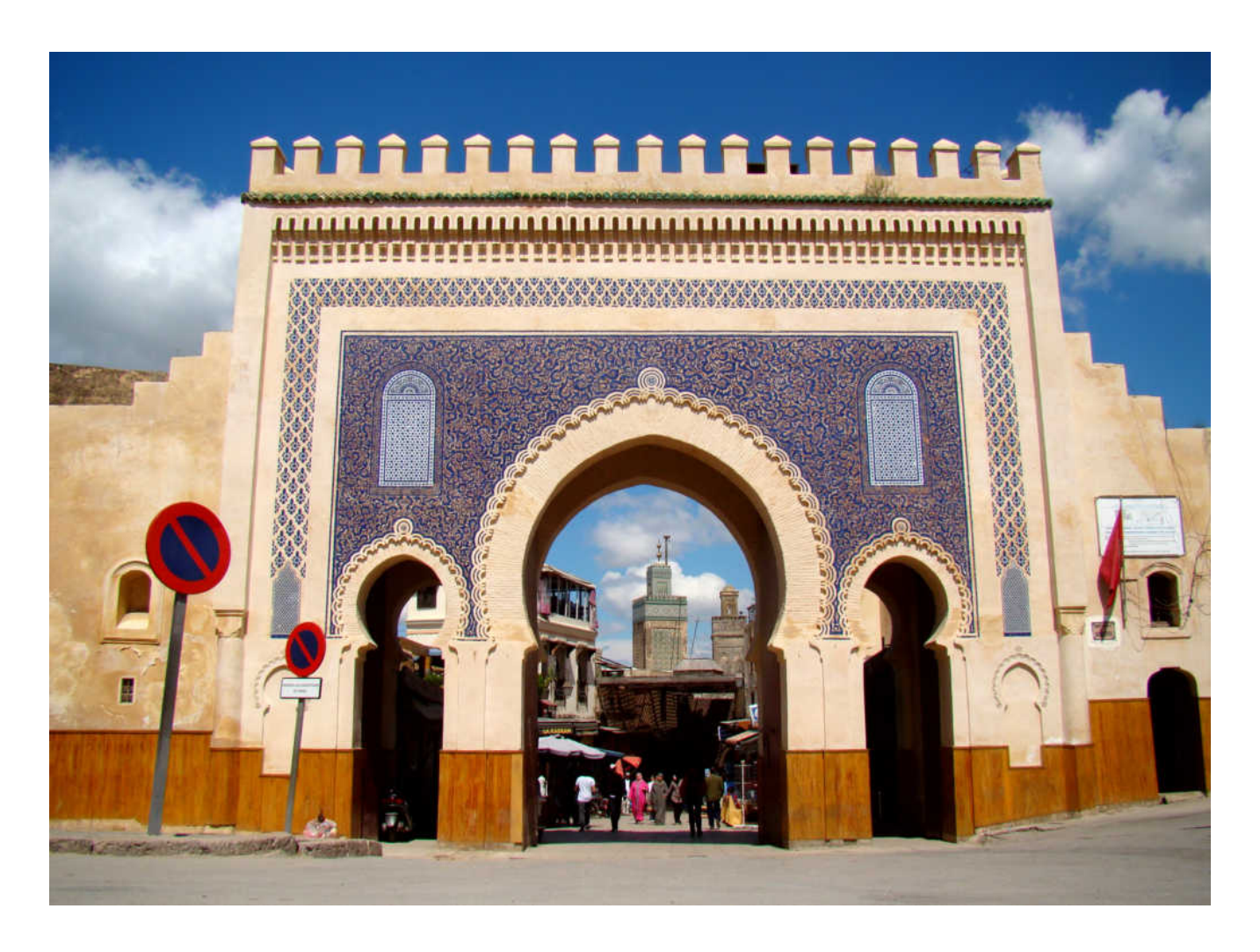
Day 7: ARRIVAL IN RABAT

Travel to Moroccos capital – Rabat. Rabat, Morocco's capital, rests along the shores of the Bouregreg River and the Atlantic Ocean. It's known for landmarks that speak to its Islamic and French-colonial heritage, including the Kasbah of the Udayas. This Berber-era royal fort is surrounded by formal French-designed gardens and overlooks the ocean. The city's iconic Hassan Tower, a 12th-century minaret, soars above the ruins of a mosque. Enroute stop at Volubilis to explore the Roman Ruins and visit the imperial city of Meknes. Meknes is a city in northern Morocco. It's known for its imperial past, with remnants including Bab Mansour, a huge gate with arches and mosaic tiling. The gate leads into the former imperial city. The Mausoleum of Sultan Moulay Ismail, who made the city his capital in the 17th century, has courtyards and fountains.