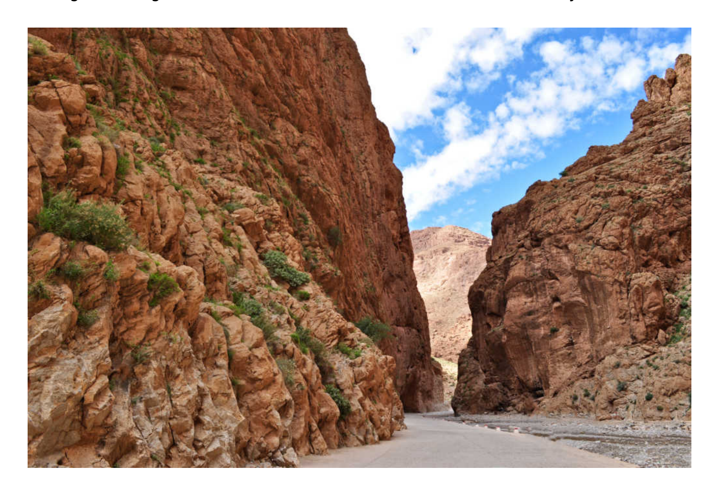
Day 5: VISIT TO SCENIC TOWN OF IFRANE

Visit to to Todra Gorge and Merzouga, Being stuck between a rock and a hard place is a sublime experience in the Todra Gorge, where a 300m-deep fault splits the orange limestone into a deep ravine at some points just wide enough for a crystal-clear river and single-file trekkers to squeeze through. The road from Tinerhir passes green palmeraies (palm groves) and Berber villages until, 15km along, high walls of pink and grey rock close in around the road. The approach is thrilling, as though the doors of heaven were about to close before you.