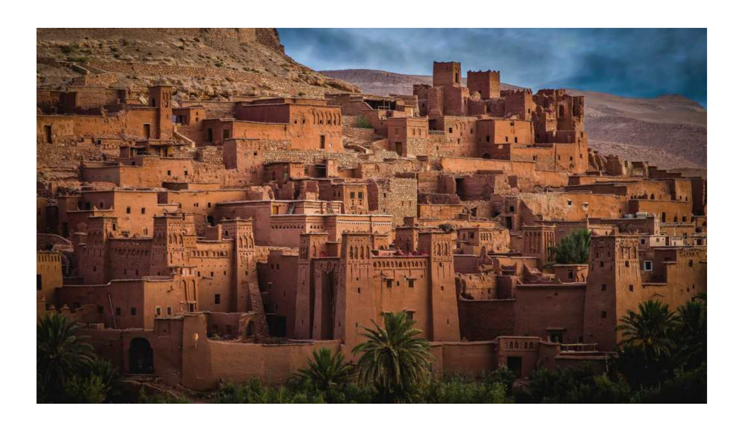
Day 2: VISIT TO MAJORELLE GARDENS

The garden was made in the 1920s by the French painter Jacques Majorelle, with marble pools, raised pathways, banana trees, groves of bamboo, coconut palms and bougainvilleas. Perhaps unsuprisingly as the garden was designed by a painter, the garden is composed and coloured like a painting.