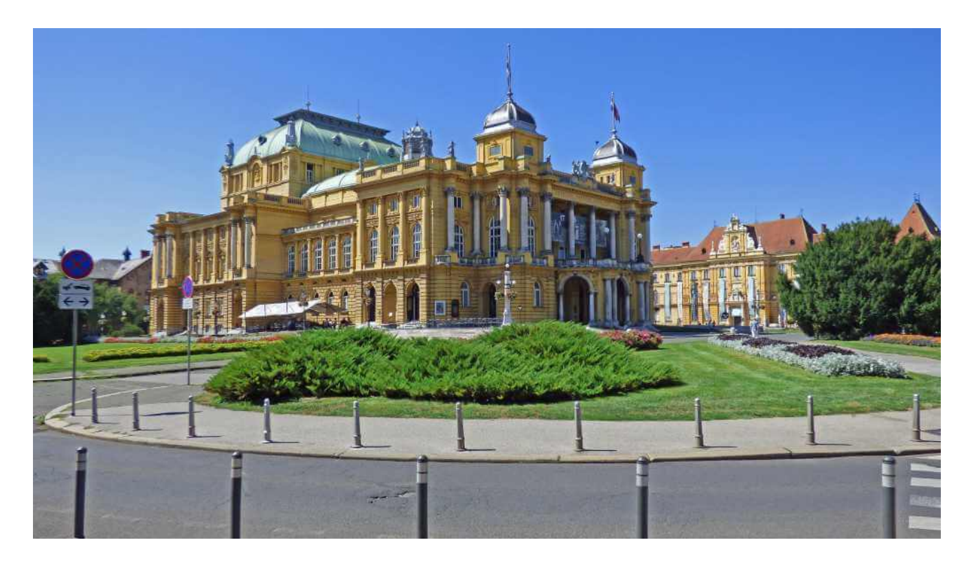
DAY 11: LJUBLJANA AND LAKE BLED DAY TOUR

We arrive into our final destination today. After check in, a city exploration of the Capital of Croatia. We Learn about Zagreb history and culture as you take in architectural landmarks, the Mirogoj Cemetery, and the cobblestone streets of Upper Town.