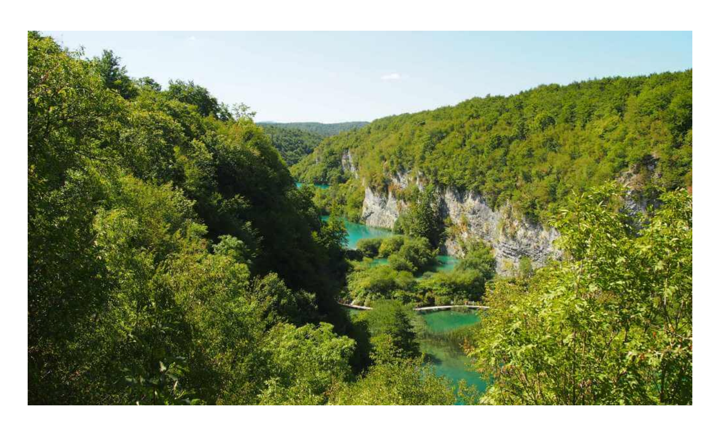
DAY 10: TO ZAGREB & CITY TOUR

We arrive into our final destination today. After check in, a city exploration of the Capital of Croatia. We Learn about Zagreb history and culture as you take in architectural landmarks, the Mirogoj Cemetery, and the cobblestone streets of Upper Town.