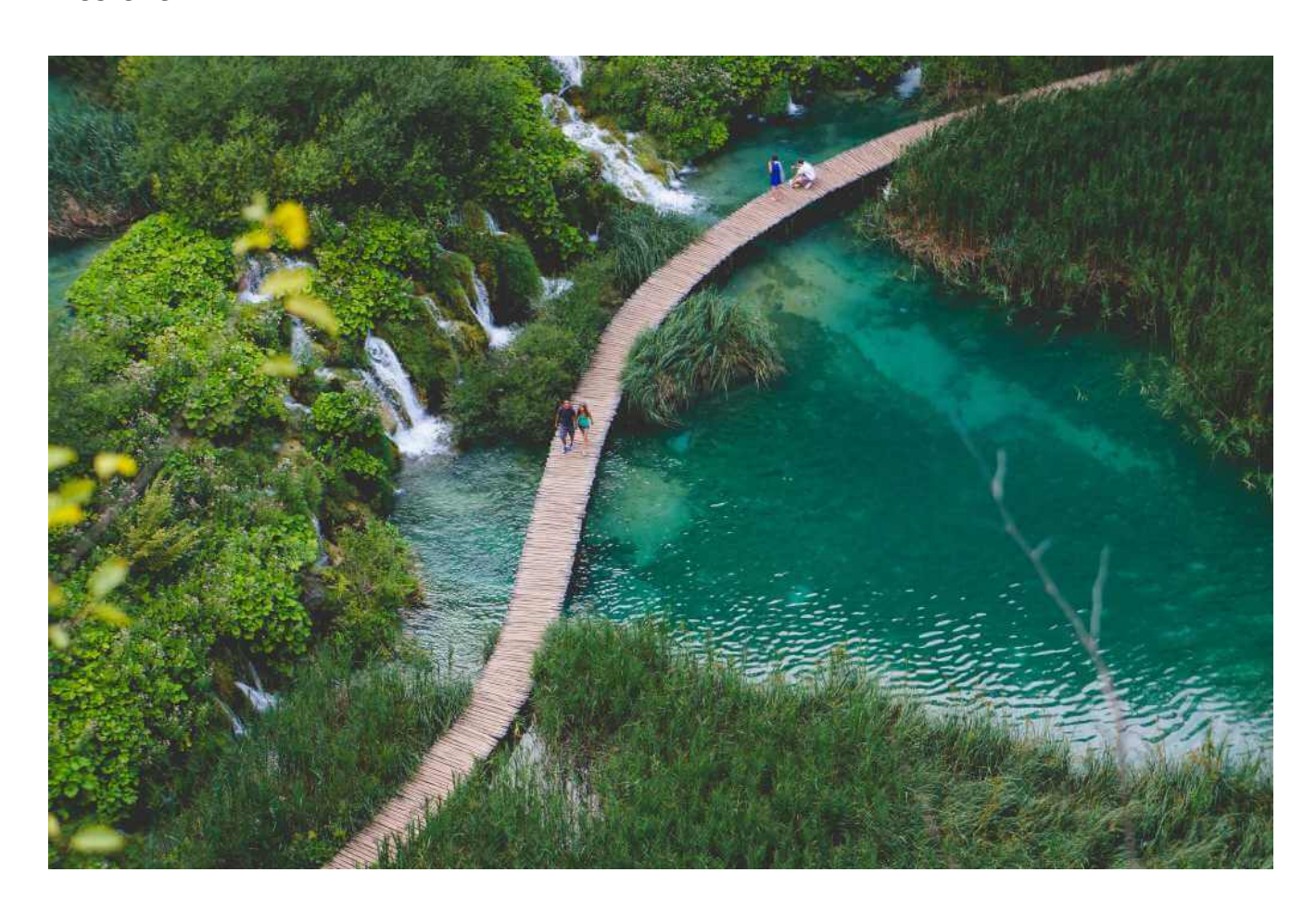
DAY 09: LAKE EXPLORATION CONTINUED

Leave Split after breakfast and head on ahead to our next destination which is often considered one of the Natural Wonders of the World The Plitvice Lakes. After check in leave for the lakes and explore the Emerald colour waters, gushing waterfalls all of which is surrounded by lush green trees making it one of the best hikes ever.