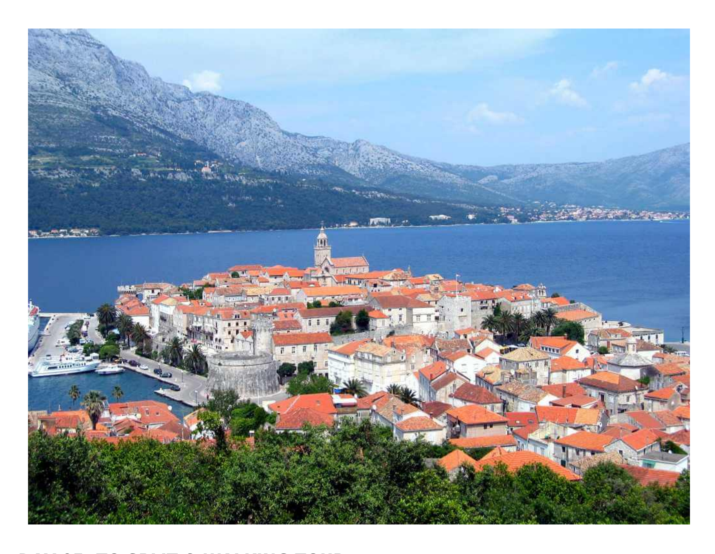
DAY 05: TO SPLIT & WALKING TOUR

Check out of Dubrovnik and move ahead to Split. This beautiful town is actually a Palace built by a Roman Emperor for when he would retire. He didn't live that long, but his palace did and the entire town now lives inside the palace premises- such huge is the size. In the evening, we do a small walking tour of this city cum palace.