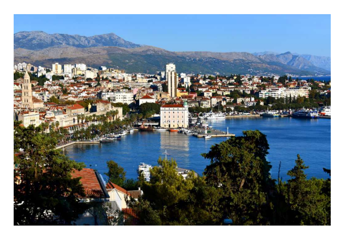
DAY 07: 05 ISLAND TOUR FROM SPLIT

Discover the Marvels of the Adriatic Sea today. Hop a board the boat and leave to visit Natural Phenomenons. The Blue Cave and the Green Cave. Apart from this we visit the quaint town of Hvar and lastly finish off with Komiza.