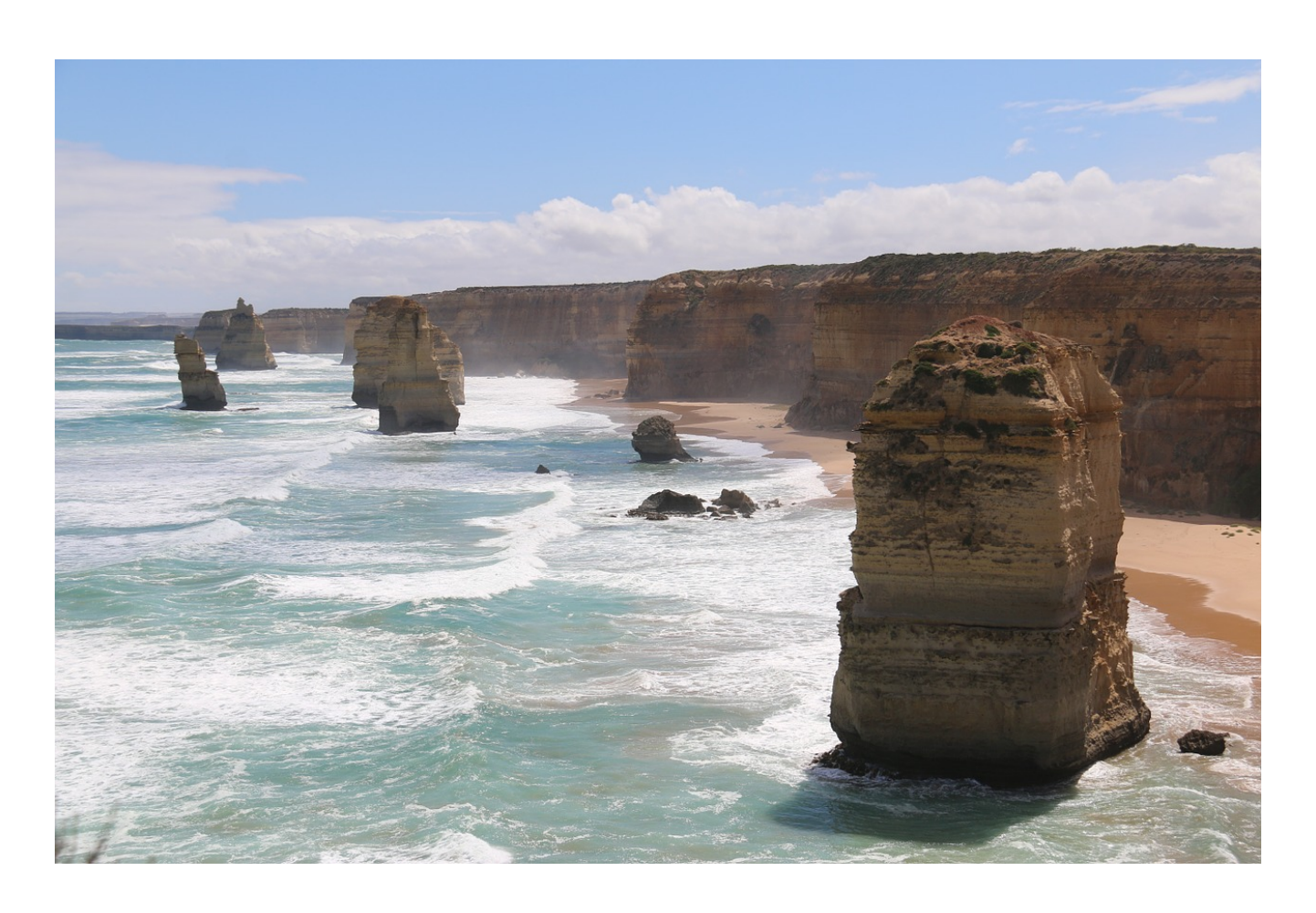
DAY 05: TO GOLD COAST & FREE DAY

Check out of your hotel in the morning today as you leave to catch your flight o Gold Coast. Upon arrival and post check in, you have the day to yourself to self explore the very happening and vibrant city of Australia- The Gold Coast. Overnight in Gold Coast.