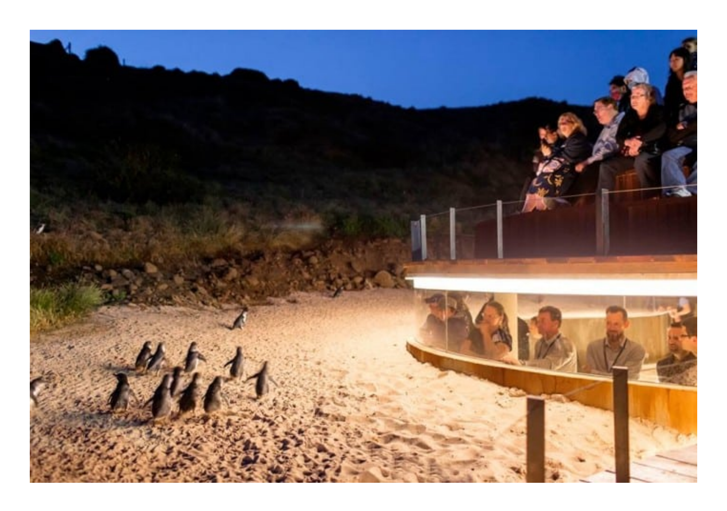
DAY 04: GREAT OCEAN ROAD TOUR

After breakfast, you leave to discover some of the most beautiful landscapes of Australia on this full day tour from Melbourne. Enroute take various stops which include tea stops, Wild Koala Viewing Spots, Apollo Bay etc and Lastly view the amazing 12 Apostles and return back. Overnight in Melbourne.